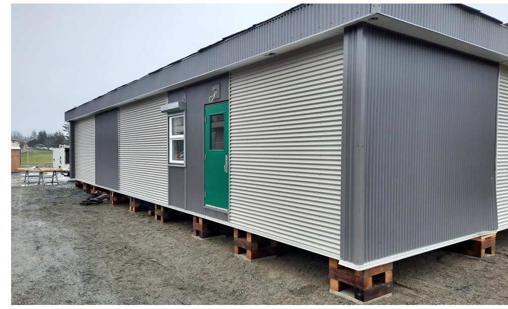
New Build at Forest Park

NLPS subsidizes user groups and rental groups. While certainly being a community partner is important and many of the rental groups include families, NLPS has insufficient funding to maintain assets for school use, let alone external use. The outcome of this recommendation would be a review of rates and a consultation process prior to any changes above that would include recommendations for yearly adjustments due to inflation.